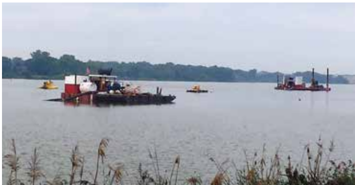
Dredging to remove contaminated sediments continues on the Fox River.

Sediment is removed through a special dredging process designed to provide minimal disturbance to the riverbed, thereby minimizing the movement of PCBs into the river. The sediment is dewatered at the State Street facility on the west shore and then trucked to landfills. Higher contaminated sediments, greater than 50 parts per million, go to the Ridgeview Recycling and Disposal facility in Whitelaw, near Manitowoc. Less contaminated sediments are transported to the Veolia Hickory Meadows Landfill in Chilton.”