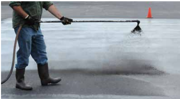
Sealcoats are typically applied by spraying onto the surface.

The common practice of using coal tar sealcoats (because it's cheaper than alternative technologies), which contain polycyclic aromatic hydrocarbons (PAHs), have been linked to a host of problems in fetuses and infants that continue well into their adult lives—lower IQ, childhood asthma, low birth weight, heart malformations, behavioral issues and anxiety/depression. The health hazards extend to aquatic lifeforms, as the PAHs find their way into the town's lakes and streams. And while PAHs can be found anywhere fossil fuels are used—oil, coal, gasoline, etc.—their use with tar-coal sealcoats dramatically increases exposure risks to