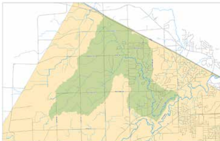
Trout Creek Watershed

Fifteen years ago, an Oneida community member complained that he thought it was awful that his dogs would get sick from drinking out of the creek. The Oneida Water Resources Team began to investigate. They took water samples at County Highway U during a rain storm in the fall of 1999. The results of those samples were shared and an amazing thing happened. A partnership formed between the Oneida Tribe and several state, local and federal agencies with the goal of cleaning up the agricultural runoff to the stream. While the Wisconsin Department of Natural Resources, Brown and Outagamie County Land Conservation Departments and the Department of Corrections worked on the biggest problem to the stream (manure runoff at the State farm), the Oneida Water Resources Team surveyed the Trout Creek watershed (see next column) to prioritize projects to restore it. Meanwhile,