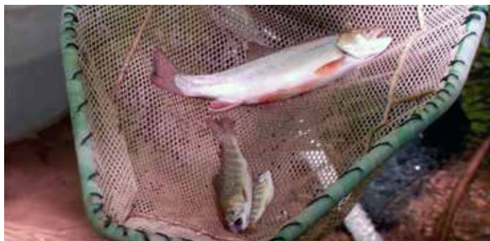
Three size classes of brook trout in Trout Creek in 2011.

The most recent restoration project was completed last fall on a headwater reach between Olson Road and County Highway U. Management and protection efforts will continue to further strengthen the integrity of the stream.